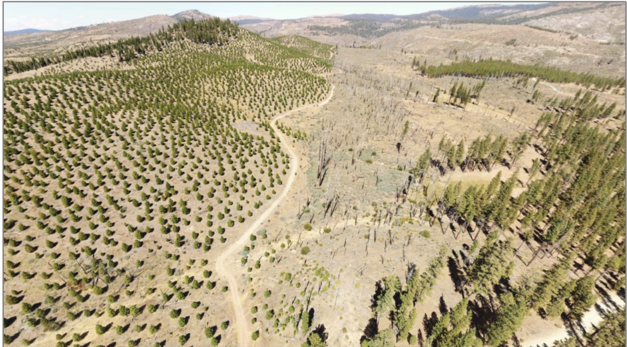
Figure 5 - USFS (right) private land (left) boundary. The change from forest to shrub can be detected by the existing Post Wildfire Vegetation Monitoring System.

Step 5-Plumas County Field Case Study of Stream Condition: Within the Dixie and Moonlight Fires, 3 perennial and 3 ephemeral streams will be selected for detailed field study examining current condition of riparian areas in burned areas along private and public land boundaries. Within these case studies, percent cover of vegetation, current reforestation, and evidence of erosion will be documented (Figure 6). In addition, case study sites will be flown using a UAV to generate current condition high resolution imagery for use in the assessment to validate cover estimates. SIG has used UAVs in this area on past projects to map vegetation at high resolution- an example of imagery collected is available here (UAV Image Data Example https://gsal.sig-gis.com/portal/apps/webappviewer/index.html?id=7cddcb5ee30d4c3e86f1463156eec8dc )