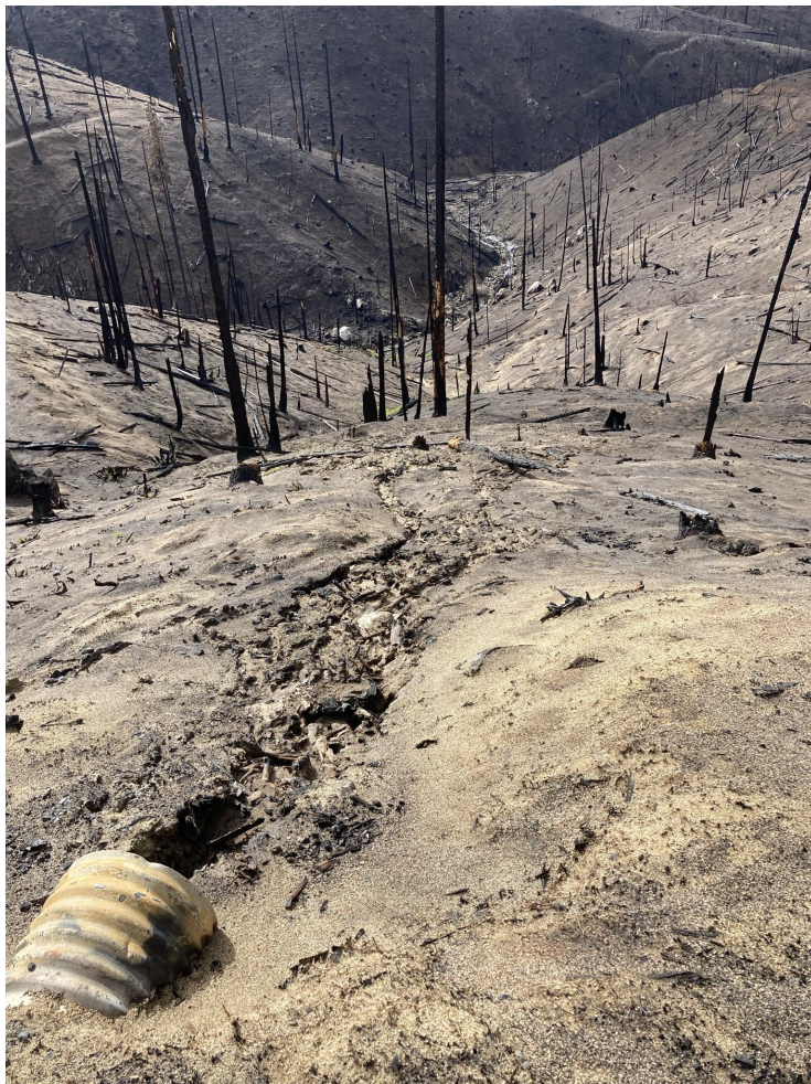
Figure 6 - East Branch of Lights Creek within the footprint of the 2021 Dixie Fire. This area also burned in the 2007 Moonlight Fire.

Step 6-Report: Data and spatial information will be summarized into report form with online maps. All geospatial data will be provided electronically in ESRI compatible format.