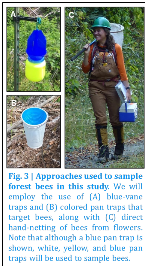
Fig. 3 | Approaches used to sample forest bees in this study. We will employ the use of (A) blue-vane traps and (B) colored pan traps that target bees, along with (C) direct hand-netting of bees from flowers. Note that although a blue pan trap is shown, white, yellow, and blue pan traps will be used to sample bees.

During the last sampling round in each year we will collect data on potential nesting resources for be bees. We will measure (1) the amount of exposed soil, (2) the extent and depth of subsurface soil compaction via a handheld penetrometer, and (3) the amount of appropriate woody debris available to stem-nesting bees (i.e., hollow or pithy twigs) in three size classes (i.e., 1-5 mm, 6-10 mm, 11-15 mm diameter); we will make these measures within a 3-m radius circle centered on each blue vane trap location. We will also measure canopy cover, slope, and aspect at stand center because they may influence pollinator communities.