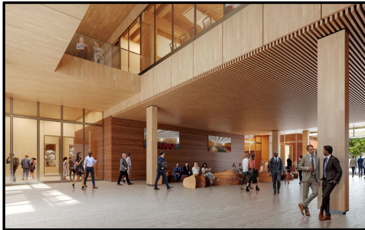
Figure 2. San Mateo County Administration Building

As previously discussed, Sonrisa is the first residential project in Sacramento built with cross laminated timber. Cross laminated timber was used for horizontal components, i.e., ceilings and floors. The building also features all-electric heating, low volatile organic compound materials, and low water demand landscaping. The Sonrisa project is portrayed below (artist rendering) in Figure 3.