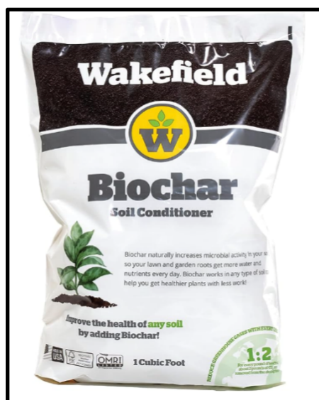
Figure 4. Wakefield Biochar

The Sonoma Biochar Initiative is dedicated to promoting biochar education and its sustainable use throughout California. 66 It is supported by several Resource Conservation Districts, the International and U.S. Biochar Initiatives, and other agencies and private companies. The initiative received three grants from CAL FIRE under the Business and Workforce Development program. One will address emissions related to the use of Ring of Fire biochar kilns. 67 A second grant will fund a feasibility analysis for a biochar production facility in Sonoma County. The third will fund a marketing study focused on the San Francisco Bay area looking specifically at compost facilities, dairies (co-composting biochar and manure) and stormwater filtration applications. Research on biochar soil amendment effects on vineyard productivity are also underway. As previously noted, Caltrans is currently experimenting with the use of biochar as a stormwater pollutant filtration method. Several scientific studies have firmly established the value of biochar for stormwater treatment. 68