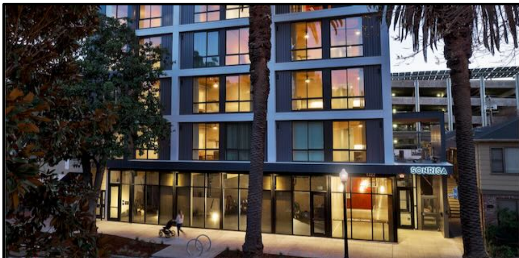
Figure 3. Sonrisa Building

As previously discussed, Sonrisa is the first residential project in Sacramento built with cross laminated timber. Cross laminated timber was used for horizontal components, i.e., ceilings and floors. The building also features all-electric heating, low volatile organic compound materials, and low water demand landscaping. The Sonrisa project is portrayed below (artist rendering) in Figure 3.