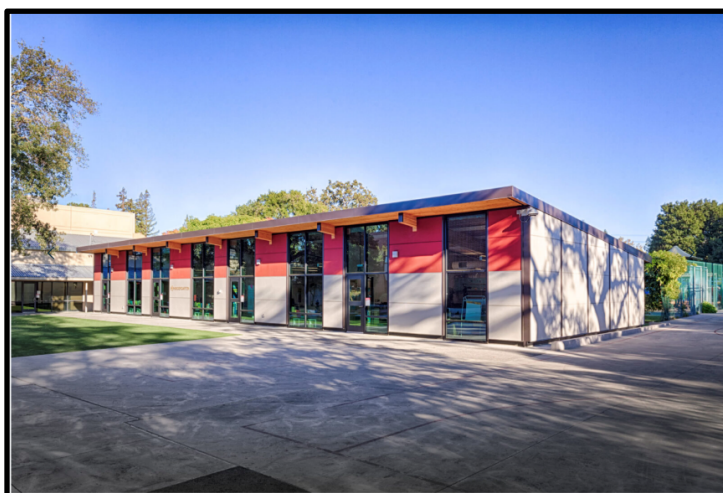
Figure 1. Sacred Heart School, Atherton

The County of San Mateo completed a 208,000 square foot government office building that is constructed of mass timber including wood columns, beams, and cross laminated timber floor decks. The county claims that it is the first net-zero energy design civic building in the U.S. 61 Figure 2 is an artist's rendering of the county's administration building interior.