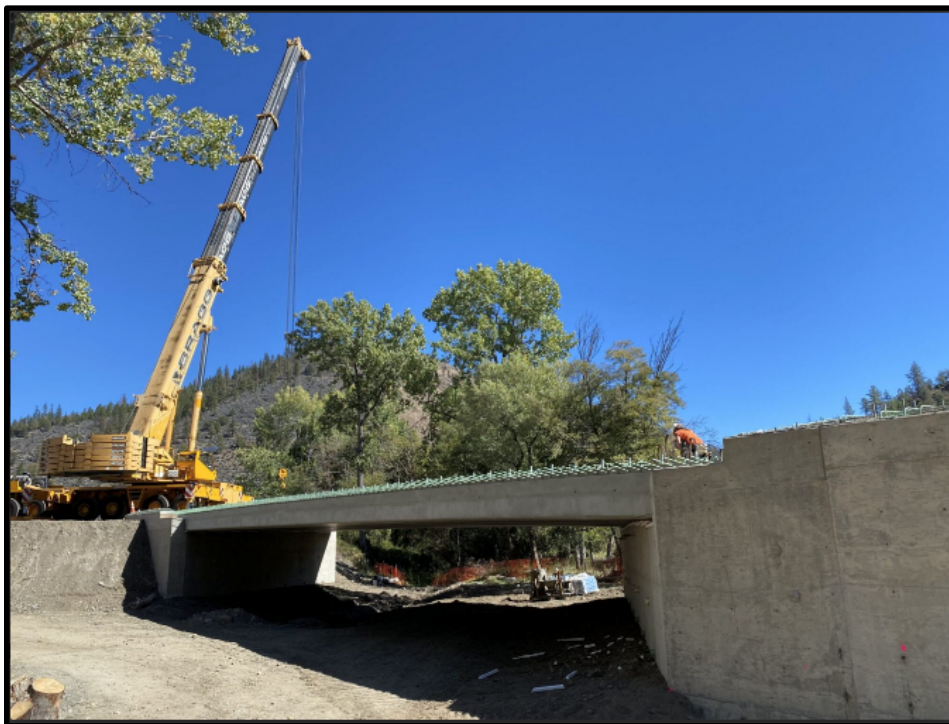
Figure 5. Nanocrystal and Biochar Infused Cement Beams

Incorporating biochar into cement has received increased attention, particularly in Europe. The benefits of adding biochar to cement and concrete include improved mechanical properties, reduced embodied carbon in buildings and road infrastructure and potential for retention of pollutants. 70 No examples of biochar concrete projects were identified in California.