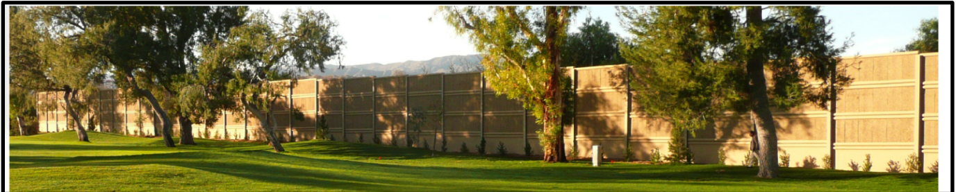
Figure 6. Wood Wool Cement Sound Wall