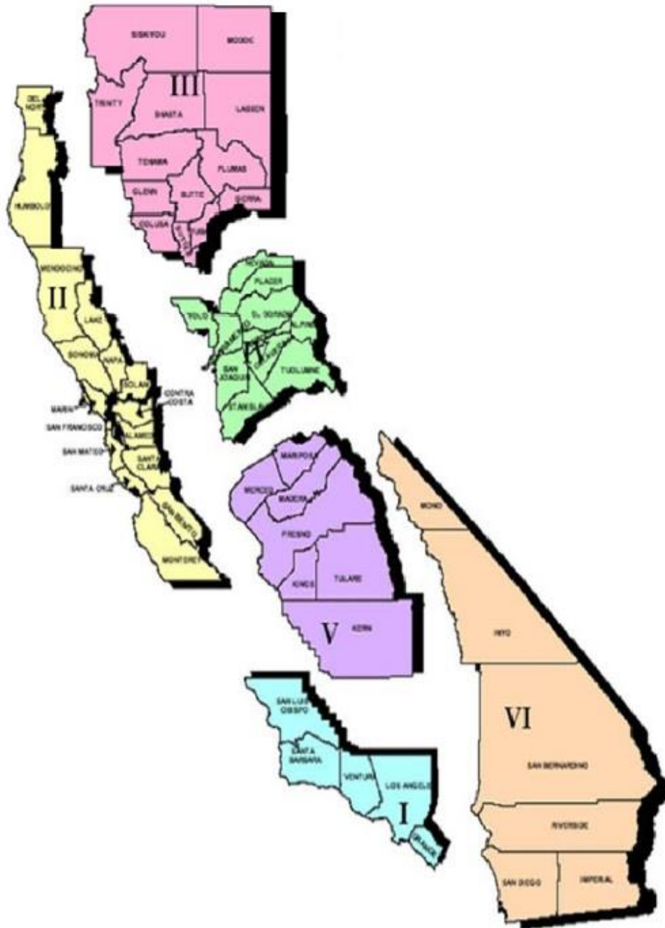
Figure: California Mutual Aid Regions

The following Mutual Aid Region designations apply to Palos Verdes Estates: