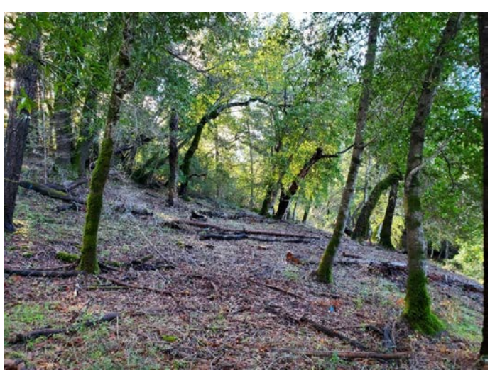
Post treatment photo point 15a