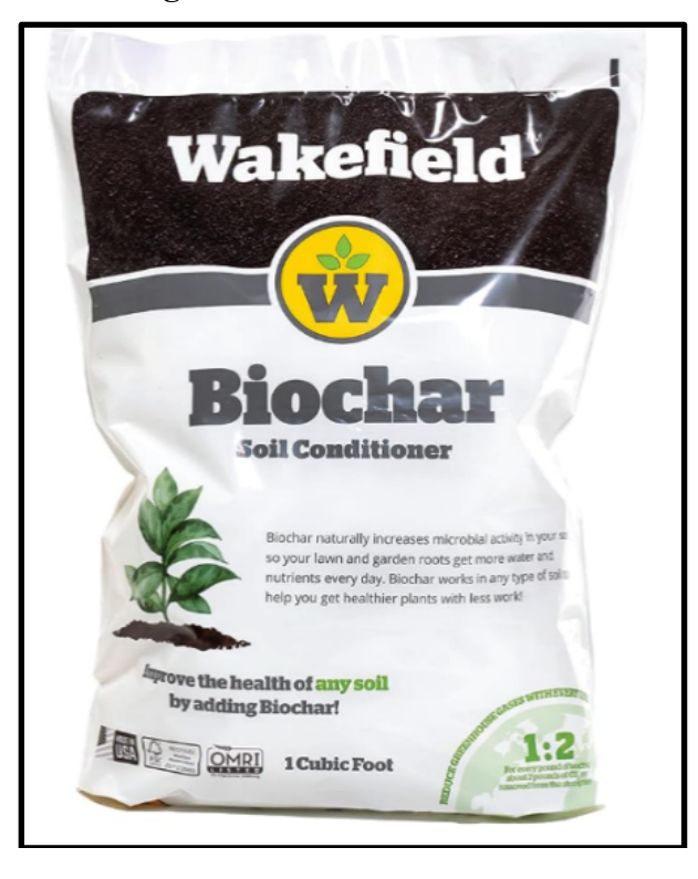
Figure 4. Wakefield Biochar

Biochar has numerous applications, but it has most promise as a soil amendment, filtration medium for stormwater and wastewater, and agent for remediation of hazardous wastes. Wakefield Biochar<sup>68</sup> soil amendment (see Figure 4) is commercially available at outlets such as Home Depot and Lowes, selling for $39 cubic/foot. Nationally, the average price for biochar in 2023 was $100/cubic yard or $131/metric tonne.<sup>69</sup> Rogue Biochar in Oregon cites a price of $70/cubic yard or about $90/metric tonne for large quantities.<sup>70</sup>