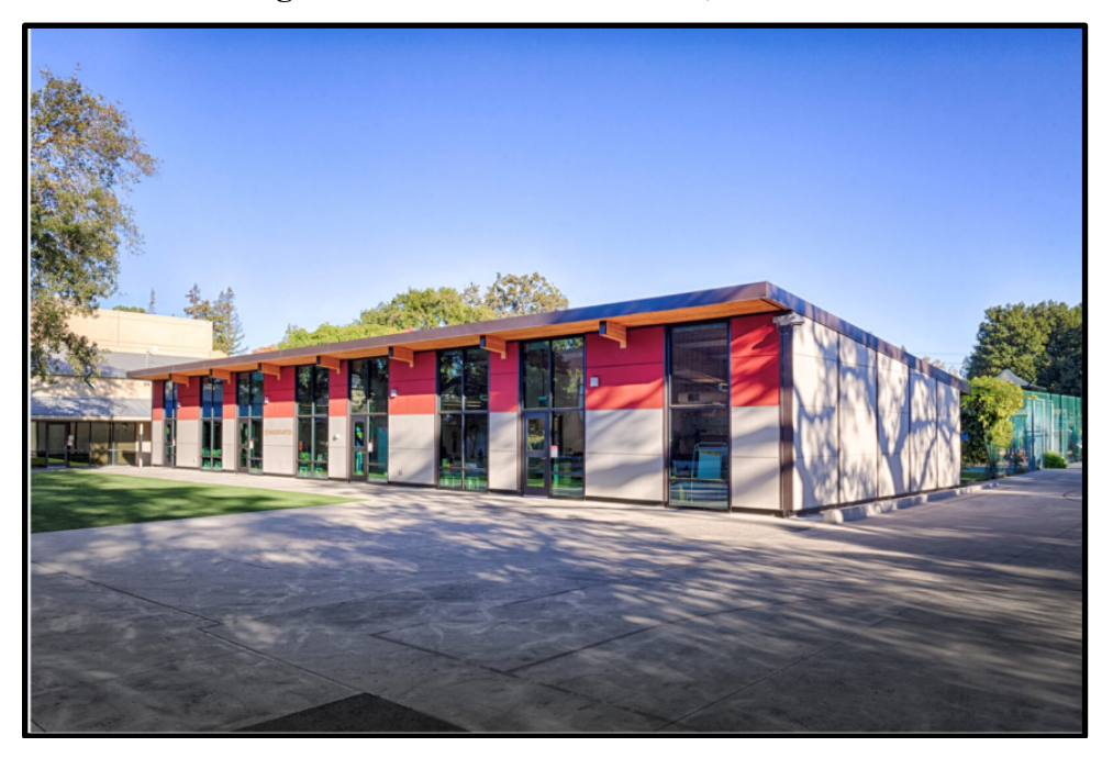
Figure 1. Sacred Heart School, Atherton

In 2021, three San Francisco construction companies partnered to create TimberQuest,<sup>64</sup> a company providing mass timber modular classrooms. As of 2023, TimberQuest had built two mass timber school buildings for private clients: Sacred Heart School in Atherton (pictured below in Figure 1) and Stratford School in Pleasanton. As of September 2023, they were designing a school building for the Palo Alto Unified School District. TimberQuest partners (XL Construction and Aedis Architects) are also in design or completion phases for mass timber projects in Campbell and San Mateo County.