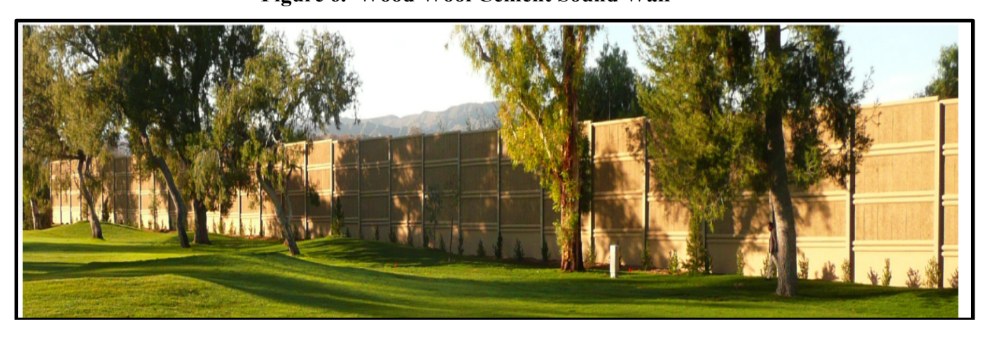
Figure 6. Wood Wool Cement Sound Wall

Troy currently obtains its wood wool cement panels from manufacturing facilities in Latvia and Sweden. It has had several projects in California. These include construction of shooting ranges for local police and sheriff's departments, including the Los Angeles Police Department, a sound wall installation at the Valencia Golf Course bordering Interstate 5 in Santa Clarita (pictured in Figure 6), and recording studios in Los Angeles. The company founder, Bill Bergiadis, holds the patent for the highest rated sound attenuation product in the world.<sup>78</sup> In addition to other projects in the greater U.S. for private companies, Troy has built projects for the U.S. Navy and U.S. Army on military bases in Japan, Hawaii, and elsewhere.