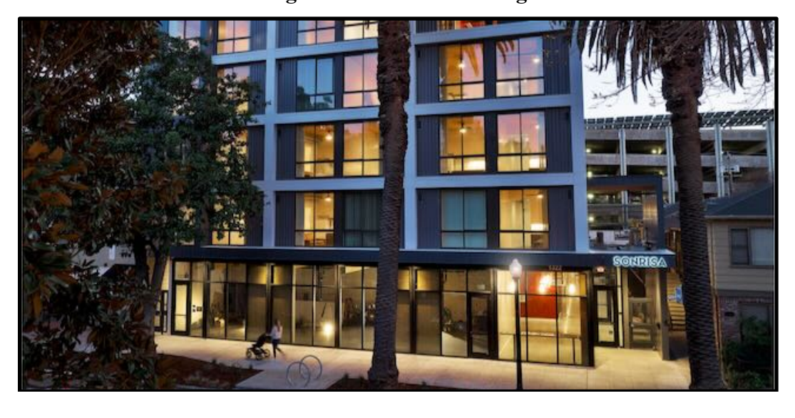
Figure 3. Sonrisa Building

As previously discussed, Sonrisa is the first residential project in Sacramento built with CLT, which was used for horizontal components (i.e., ceilings and floors). The building also features all-electric heating, low volatile organic compound materials, and low water demand landscaping. The Sonrisa project is portrayed below (artist rendering) in Figure 3.