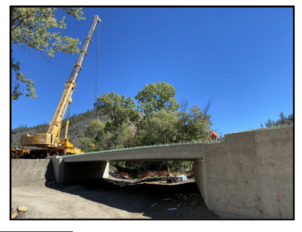
Figure 5. CNC- and Biochar-Infused Concrete Beams

Incorporating CNCs produced by acid hydrolysis into cement has been demonstrated through research studies to increase its hydration and strength. The Moffett Creek bridge replacement in Siskiyou County was done with precast concrete beams using CNCs provided by the U.S. Forest Service, Forest Products Laboratory. The beams were manufactured at the Knife River Prestress plant in Harrisburg, Oregon. The addition of the nanofibers resulted in similar or slightly better concrete properties when compared with conventional concrete. This was the first full-scale demonstration of CNCs as an additive for concrete. The environmental benefits of adding CNCs to cement are associated with reduced embodied carbon in the concrete due to the addition and storage of carbon. Figure 5 shows the beams being installed.