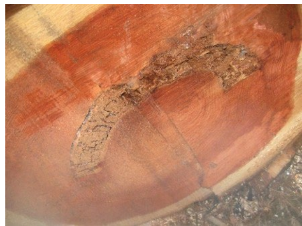
1948 Fire Damage – Defect Compartmentalized

The degree of damage sustained by a redwood tree post-fire influences the future merchantability and the development of unique habitat features.