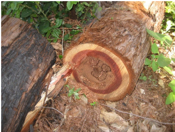
1948 Fire Damage – Defect Throughout Center

The impacts of defect introduced in redwood as a result of fire are not well understood. Trees with habitat features such as basal hollows, created by fire scars from repeat fires, are critical habitat for species such as Townsend Big-eared Bat ( Corynorhinus townsendii ). Redwood trees have been known to rot internally when burned significantly and can rot to the pith through all the wood that grew prior to the fire. Less burned trees will compartmentalize the rot.