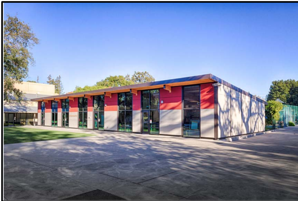
Figure 1. Sacred Heart School, Atherton

San Mateo County completed a 208,000 square foot government office building that is constructed of mass timber, including wood columns, beams, and CLT floor decks. The county claims that it is the first net zero energy design civic building in the U.S. 65 Figure 2 is an artist's rendering of the county's administration building interior.