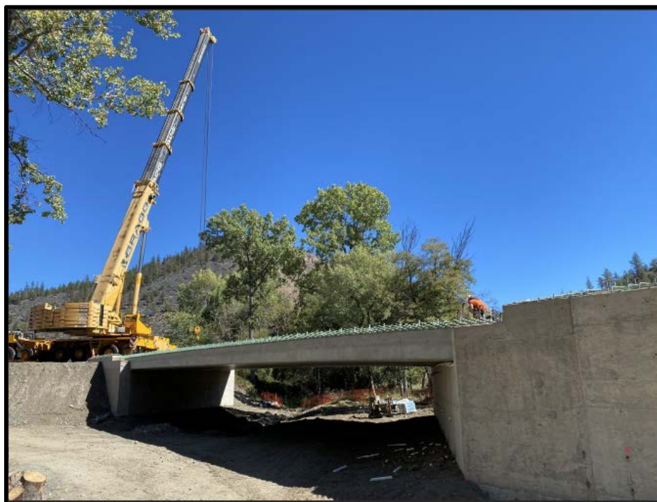
Figure 5. CNC- and Biochar-Infused Concrete Beams

Incorporating CNCs produced by acid hydrolysis into cement has been demonstrated through research studies to increase its hydration and strength. The Moffett Creek bridge replacement in Siskiyou County was done with precast concrete beams using CNCs provided by the U.S. Forest Service, Forest Products Laboratory. 75 The beams were manufactured at the Knife River Prestress plant in Harrisburg, Oregon. The addition of the nanofibers resulted in similar or slightly better concrete properties when compared with conventional concrete. This was the first full-scale demonstration of CNCs as an additive for concrete. The environmental benefits of adding CNCs to cement are associated with reduced embodied carbon in the concrete due to the addition and storage of carbon. Figure 5 shows the beams being installed.