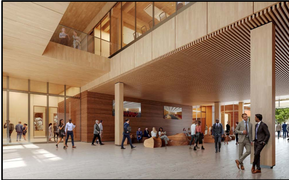
Figure 2. San Mateo County Administration Building

As previously discussed, Sonrisa is the first residential project in Sacramento built with CLT, which was used for horizontal components (i.e., ceilings and floors). The building also features all-electric heating, low volatile organic compound materials, and low water demand landscaping. The Sonrisa project is portrayed below (artist rendering) in Figure 3.