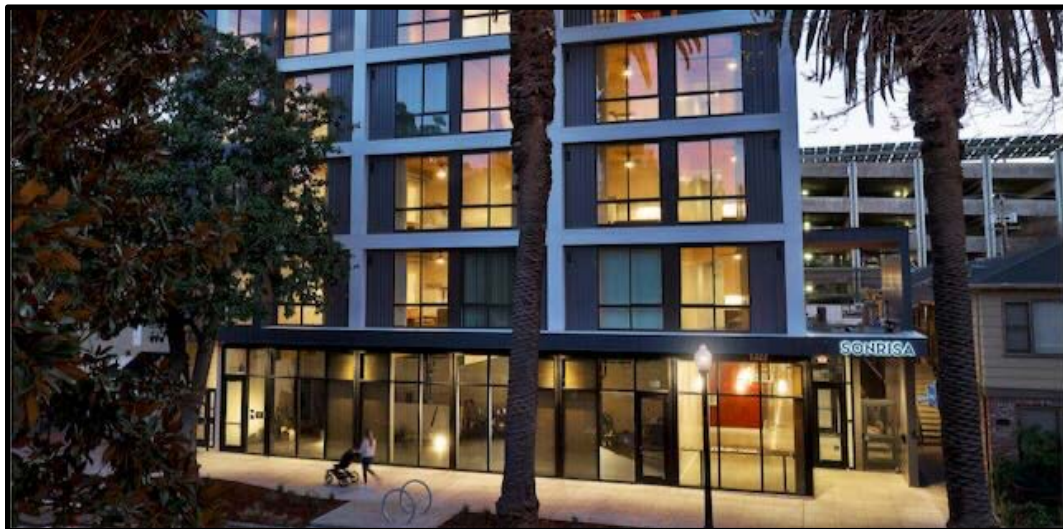
Figure 3. Sonrisa Building

As previously discussed, Sonrisa is the first residential project in Sacramento built with CLT, which was used for horizontal components (i.e., ceilings and floors). The building also features all-electric heating, low volatile organic compound materials, and low water demand landscaping. The Sonrisa project is portrayed below (artist rendering) in Figure 3.