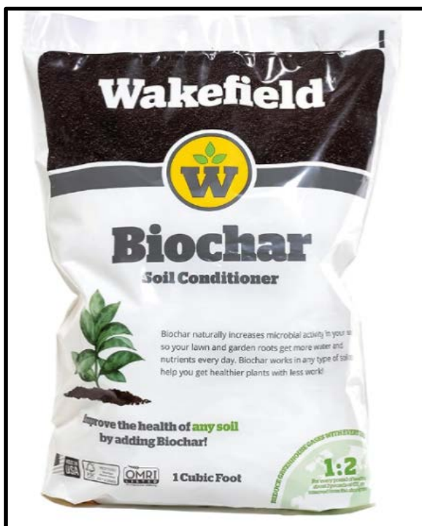
Figure 4. Wakefield Biochar

The Sonoma Biochar Initiative is dedicated to promoting biochar education and its sustainable use throughout California. 71 It is supported by several Resource Conservation Districts, the IBI and U.S. Biochar Initiatives, and other agencies and private companies. The initiative received three grants from CAL FIRE under the Business and Workforce Development program. One will address