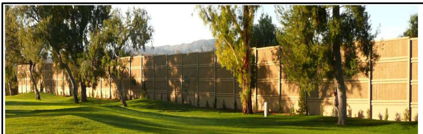
Figure 6. Wood Wool Cement Sound Wall

Troy currently obtains its wood wool cement panels from manufacturing facilities in Latvia and Sweden. It has had several projects in California. These include construction of shooting ranges for local police and sheriff's departments, including the Los Angeles Police Department, a sound wall installation at the Valencia Golf Course bordering Interstate 5 in Santa Clarita (pictured in Figure 6), and recording studios in Los Angeles. The company founder, Bill Bergiadis, holds the patent for the highest rated sound attenuation product in the world. 78 In addition to other projects in the greater U.S. for private companies, Troy has built projects for the U.S. Navy and U.S. Army on military bases in Japan, Hawaii, and elsewhere.