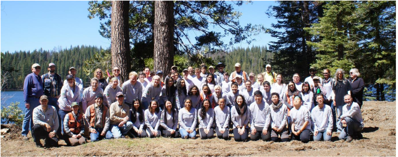
Above: Participants and volunteers for the Forestry Challenge Championship.

The top high school forestry students from throughout the state gathered recently in Pinecrest for the first-ever Forestry Challenge Championship. The Championship event was by invitation, as the top teams from the fall 2017 events were invited to participate. The event was relatively small, with 35 students from 9 schools participating. The event was April 19 to 21 at Camp Sylvester Resort, east of Sonora, California. Teams traveled from as far away as Orange County in the south to Shasta County in the north.