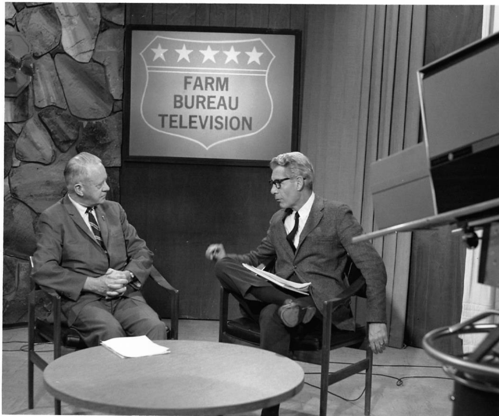
State Forester Francis Raymond being interviewed by Farm Bureau Television in 1969