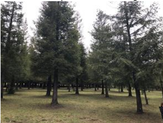
The bosque de Colon near Poio, Spain

In April 2018, Professor McElroy and several of the Coumbus Kids returned to Poio to veiw the trees and to participate in the celebration of the 25 th anniversary of the planting. Of the orignal 500 redwoods planted, 480 remain growing today and measure up to 40 feet in height.