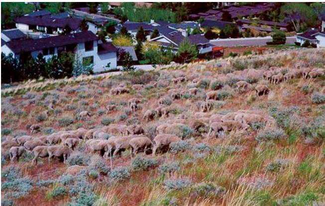
Sheep grazing a fuel break in Nevada.

electric fences. These misconceptions by the public must be addressed when land managers make proposals for grazing.