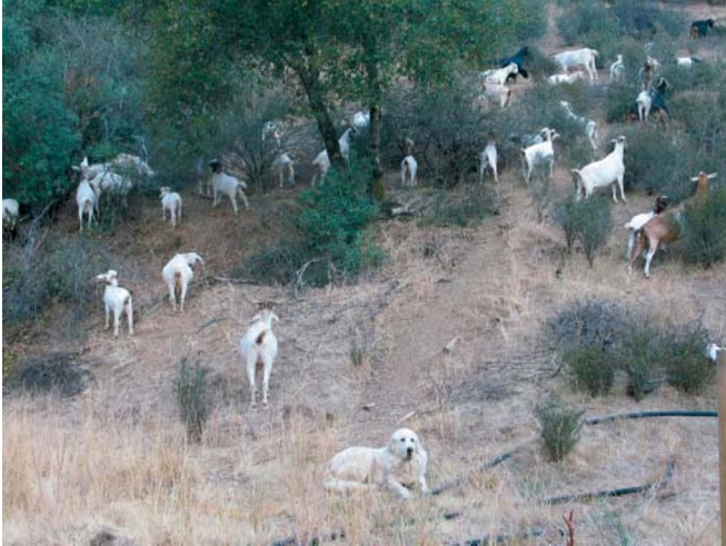
Goats grazing brush.

reported that adding cutting and herbicide use increased sheep effectiveness by reducing the brush below 20% in one year, but increased the costs. 5