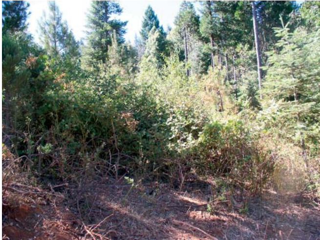
Edge of goat grazed area in Ponderosa forest.

days per acre), the basal regrowth of the oaks was closely cropped and the vegetation was maintained as predominantly open woodland. In the paddock that was grazed more moderately (49–60 cow grazing days per acre), the vegetation tended to return to dense thicket. 12