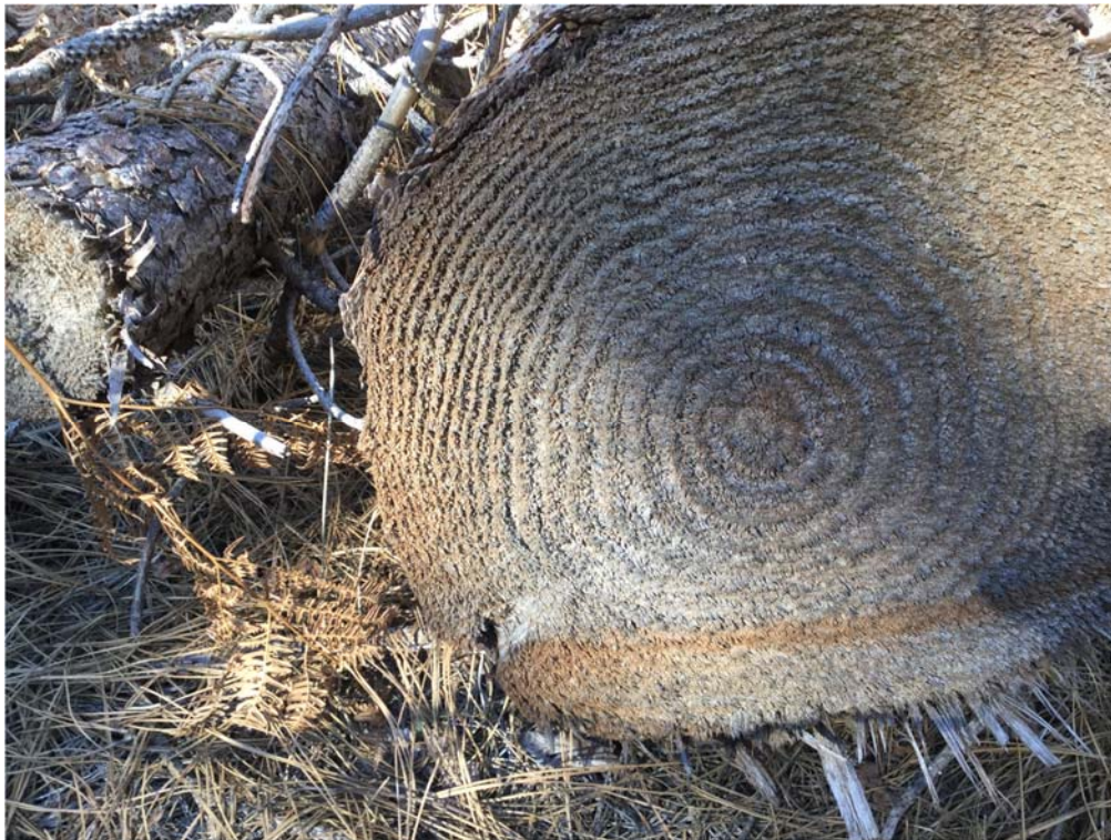
160 161 Figure 1: Cross section of tree that did not receive PCT within the optimal window. Note 162 reduced growth rings following the 10-year mark. 163

146 Diamond Resource Company properties. Attendees noted the significant improvement in 147 seedling quality and survival rates, pointing out that often they are planting trees only to thin a 148 short time after, unnecessarily adding fuels to the landscape. Data collected at U.C. Berkeley's 149 Blodgett Research Forest supports this feedback, showing planted seedling survival rates of 150 between 87-96% across half a dozen species. Foresters across the state commented that they 151 consider what site-specific stocking is appropriate for location, available resources (seeds, 152 labor, contractors, etc.), landscape level risks (who are their neighbors and what are the 153 probabilities of future fire sweeping onto newly planted site), and what future threats need to 154 be considered over many decades as they make decisions in the first decade of stand initiation. 155 Additional discussion was had around the benefits of a lower stocking standard for small 156 landowners. Attendees noted that current stocking standards require PCT to maintain forest 157 health, which is often not financially viable for small land owners or is conducted outside of the 158 optimal PCT window. Missing the optimal PCT window reduces initial investment but can also 159 reduce net growth over the next 40 years and the overall return on investment.