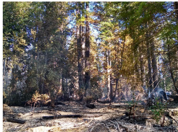
Figure 4: Parlin 17 Prescribed Burn 10/17 – 10/19/2022 within the Parlin 17 THP. Post-fire effects included mosaic burn patterns and consumption of 1 and 10-hour fuels while more charring of 100 and 1000-hour fuels.