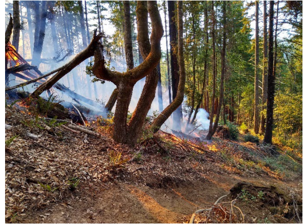
Figure 2: Parlin 17 Prescribed Burn 10/19/2022 within the Parlin 17 THP. Fire backing down slope to the control line.

A few of the plots will be burned using prescribed burning (Figure 1), to get baseline data to help fine tune the models, especially in areas that are showing more decay (i.e. 5-10 years post-harvest sites). During the prescribed burn, weather data will be taken at hour increments, and 10-hr fuel moisture stick will be on site and will be measured prior to the burn. Flame lengths and rate of spread will be observed during the burn and an attempt to compare them with the models will be made. All the variables would be put into the fire model to compare the model results with what was experienced in the field.