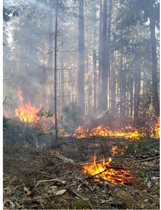
Figure 3: Parlin 17 Prescribed Burn 10/19/2022 within the Parlin 17 THP. Fire moving through about two years post-harvest.

The feasibility of prescribed burning happening within the timeframe of the grant on JDSF is pretty high. JDSF has conducted two prescribed burns (Figures 2, 3 and 4) on the Forest in the last two years, one of which was a fall burn (October 17-28 st , 2022). This proposed project would be conducted in the fall for the following reasons: 1. fires traditionally burned in the fall, 2. conditions are usually drier which could result in increased fire behavior – this leads to a better representation of burn effects to compare to a model that is not well suited for redwood/Douglas-fir mixed forests, and 3. spring in the redwood/Douglas-fir mixed forests are typically wetter longer and therefore produces more smoldering fires. JDSF is currently in the process of completing two CalVTPs for the burns where this proposed project would be located. One of the burns will take place in Fall of 2023 and the other will take place in Fall of 2024 in multiple locations across the Forest. JDSF is also actively look at opportunities to burn during the next several winters, which might provide opportunities for further burns that could be compared to models in other seasons if desired. The Mendocino CALFIRE Unit (MEU) will be assisting with all the burns on JDSF, are collaborating on the CalVTP burns to create the burn plan and determine if extra resources need to be called in to assist the Unit in these burns.